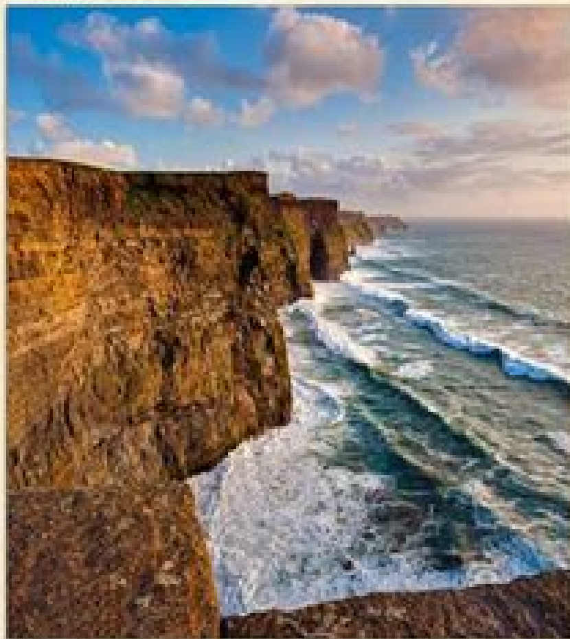
The Cliffs of Moher

T he winds that blow so frequently over Ireland have played a major part in shaping both her landscape and history. They are a constant factor in the climate and there are few days in the year when the air is still. Savage western gales from the Atlantic, icy gusts crossing Europe from Siberia and warm African breezes originating in the Sahara, all end up on the Irish shores. These never-ending patterns of winds cause the changes in light which make the landscape hazy and moored on one day and bright and clear on another.